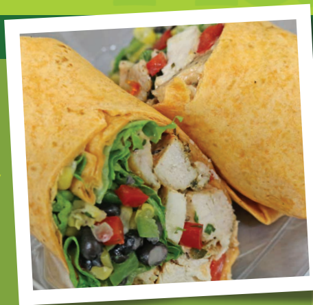
Chicken Chipotle Wrap