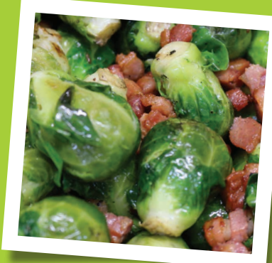
Brussel Sprouts with Pancetta