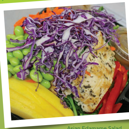
Asian Edamame Salad